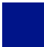
PANTONE Reflex Blue RGB: 0, 20, 137 HEX: #001489

The colors used throughout RDC Coatings branding are as follows. Various shades of these colors are acceptable as well.